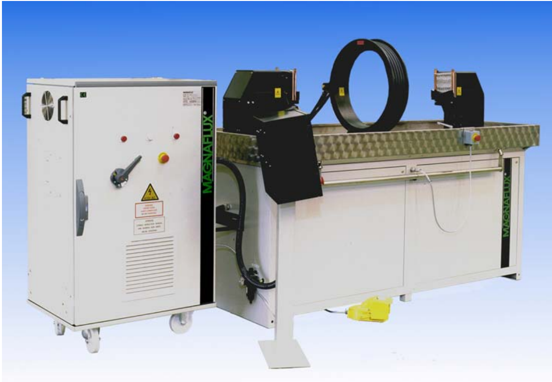
Typical Unit Layout

A range of heavy duty machines designed for the inspection of ferrous components up to 2.5 metre in length